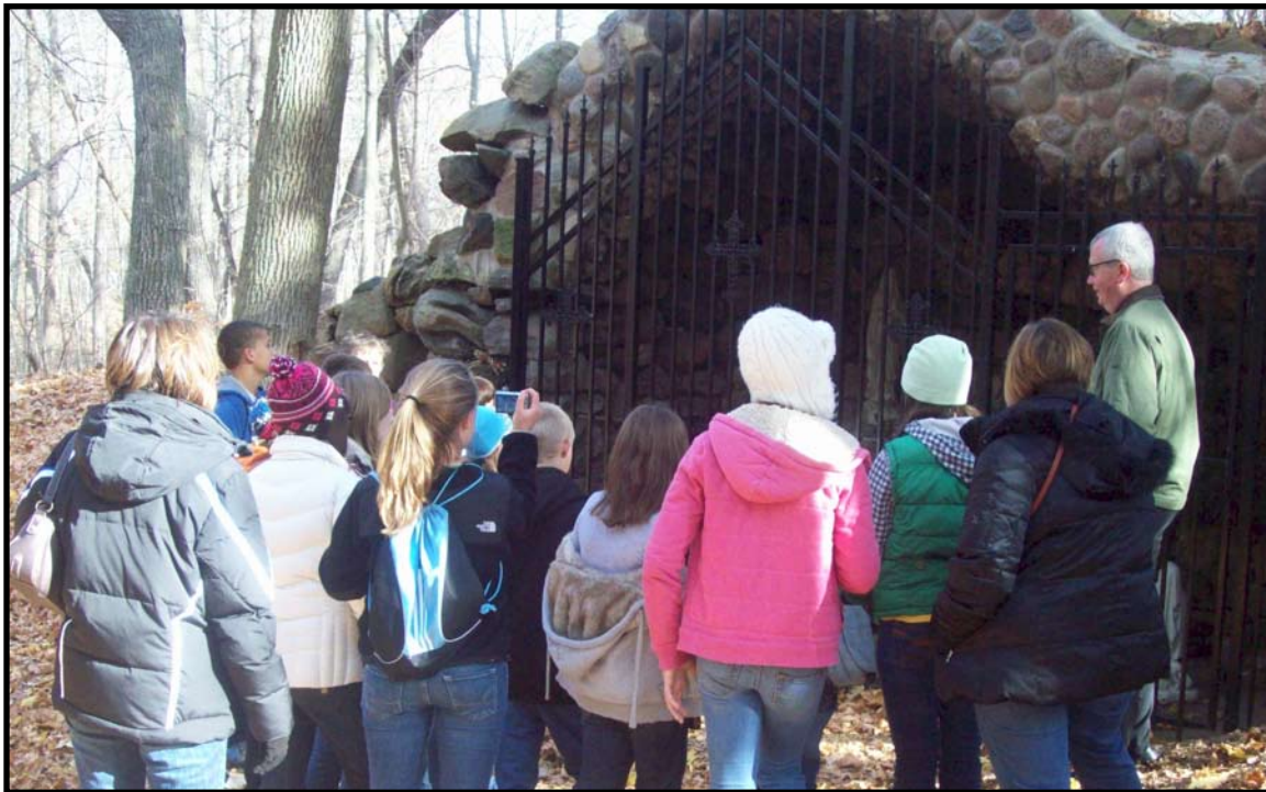
The students toured the Our Lady of Lourdes Grotto, which is located on the grounds of the St. Francis Seminary.