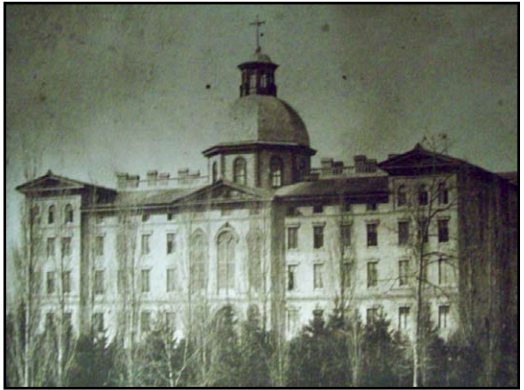
Henni Hall of St. Francis Seminary, 3257 S. Lake Drive, St. Francis, WI in 1868.

After that, the 7th grade students were off to the Wisconsin Humane Society's building at 45th & Wisconsin in Milwaukee's Merrill Park neighborhood. Students got a "behind the scenes" tour of WHS's wildlife center, the intake area for stray animals, and where dogs and cats are spayed and neutered. The highlight was when students got to play with a dog who escaped death. WHS workers explained that volunteers saved the animal, who was about to be set on fire as "a joke". Students also got to tour the adoption area for the dogs, cats, and even birds and rabbits.