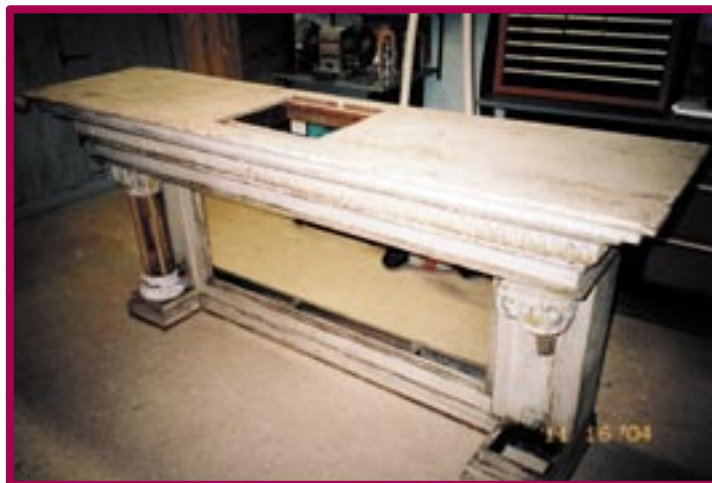
BEFORE: The altar during restoration. Note the missing column on the right.