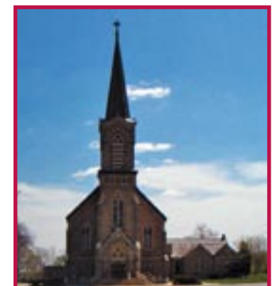
St. Stephen — Milwaukee