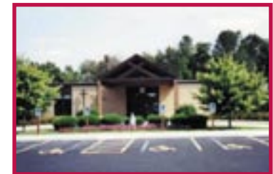
St. Mary by the Lake — Racine