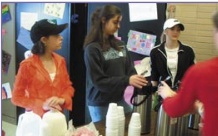
St. Matthew School 8th graders served up a pancake breakfast on Sunday, February 12 as part of their efforts to raise funds for a trip to Washington D.C.

Obviously, such an undertaking takes a lot of planning. Many people don't know that preparations actually begin a year ahead of time. Parents and others who helped organize this year's trip to Washington, actually had their first meeting last spring. One of the key aspects to planning this trip is how to raise enough money so all students can afford to go, and so the cost of the trip doesn't present a big financial burden to the students' families.