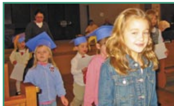
Religious Education pre-school program graduates proceed from church after receiving a blessing and their diplomas.