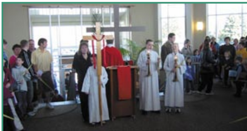
The liturgy on Palm Sunday began in the Gathering Space. From there the congregation moved to the worship space for the rest of the Mass.

Reprinted from the March 23, 2006 edition of the St. Matt's Matters School Newsletter.