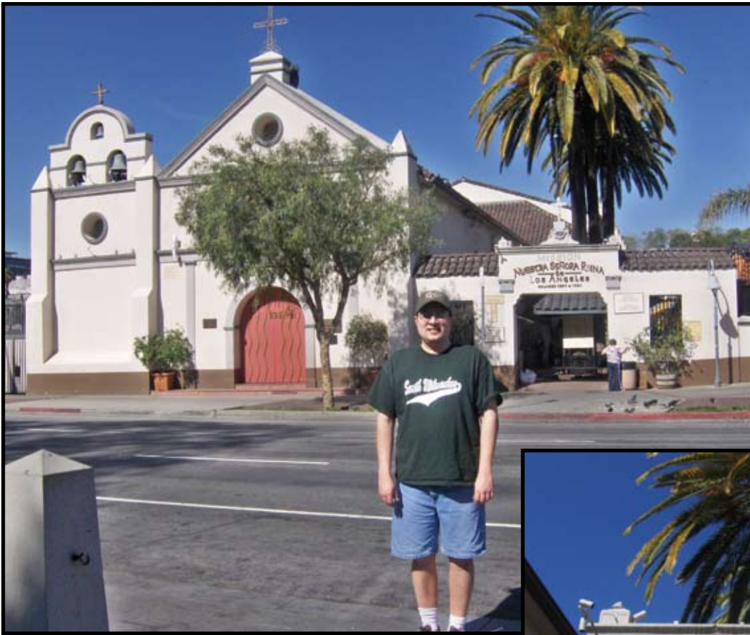
Above: the author poses in front of The Church of Our Lady the Queen of the Angels in Los Angeles, California. Inset: shows close-up of church signage seen behind the author..